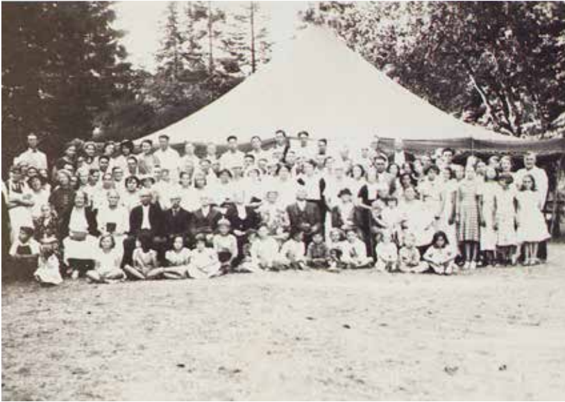
TOP One of a few pictures taken during the financially-stressed years shows a 1935 tent meeting.